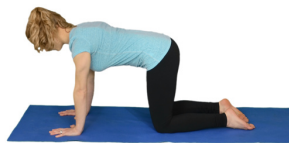
Start in 4 point