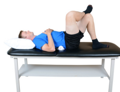
Cross leg over knee