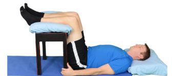
Lie on back, feet up