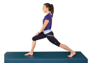
Lunge and stretch