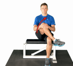
Bring knee towards opposite shoulder