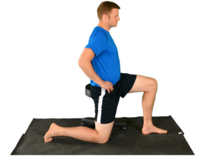
Stretch leg off side of chair as shown