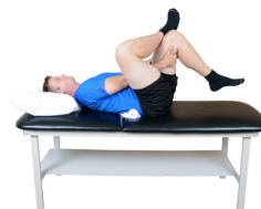
Pull knees toward chest