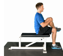
Keep good posture