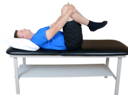
Wrap hands around knees