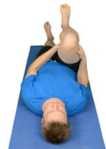
Bring knee to chest