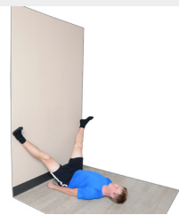
Legs form a 'V'