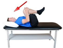
Pull knees to chest