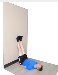
Legs straight up on wall