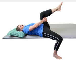
Clasp your hands behind your knee