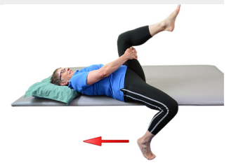
Slide heel backwards